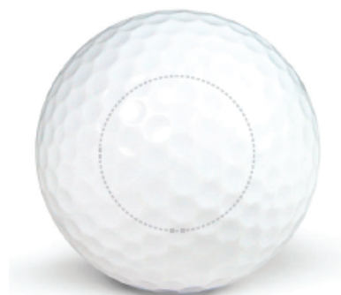
Print Area: 23mm Diameter

Please note that small details, text such as taglines and some fine fonts may appear illegible after printing due to the curved, dimpled surface of the golf ball.