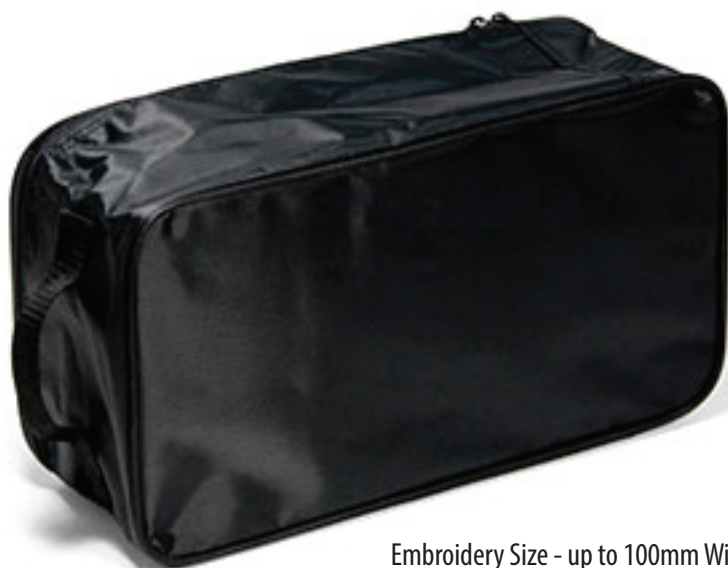
Embroidery Size - up to 100mm Wide