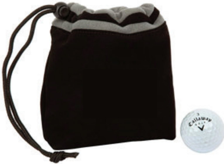
Embroidery Size - 70mm Wide